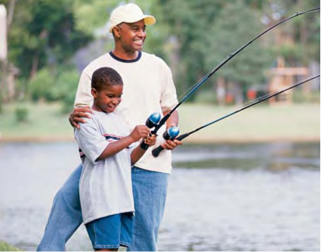
Fishing sinkers are one of the most common and readily accessible sources of lead exposure for older children and adults.