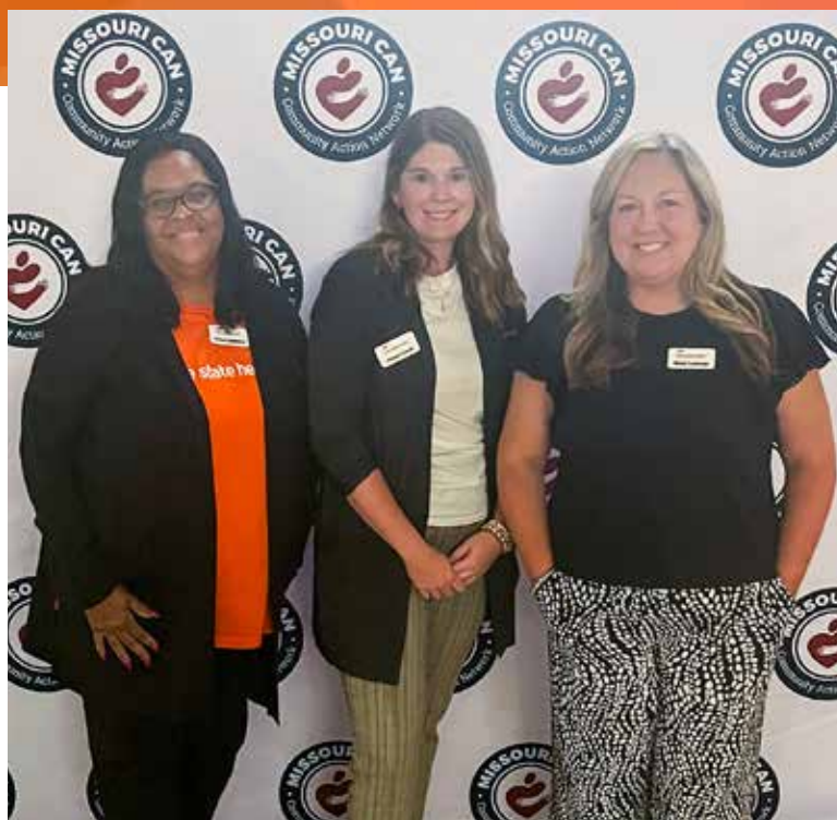
Top left: Strengthening community health by sponsoring the Iron County Health Coalition CARE Fair.