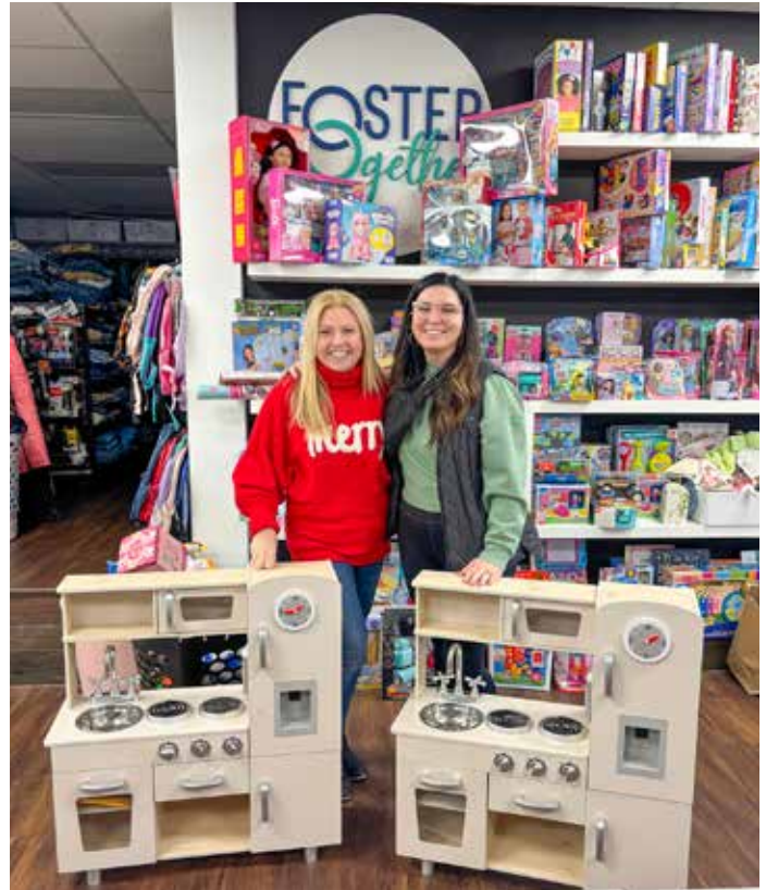
Top: Supporting teens impacted by foster care by serving as personal shoppers through the Foster & Adoptive Care Coalition’s Project Dream Dress program.