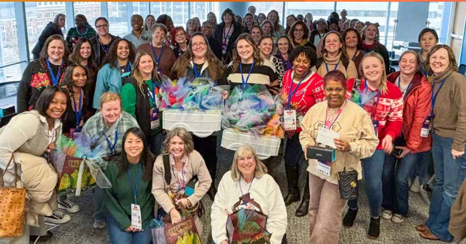
Top: Supporting confidence and celebration for Girls on the Run participants by creating Happy Hair Ties for their 5K run.

Our employees are also encouraged with paid time off to volunteer in their community in a way that is meaningful to them!