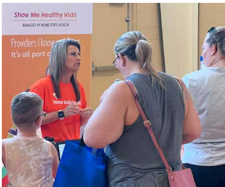
Bottom: Supporting students and families as they prepare for the school year at the Boys & Girls Club of St. Charles Back to School event.