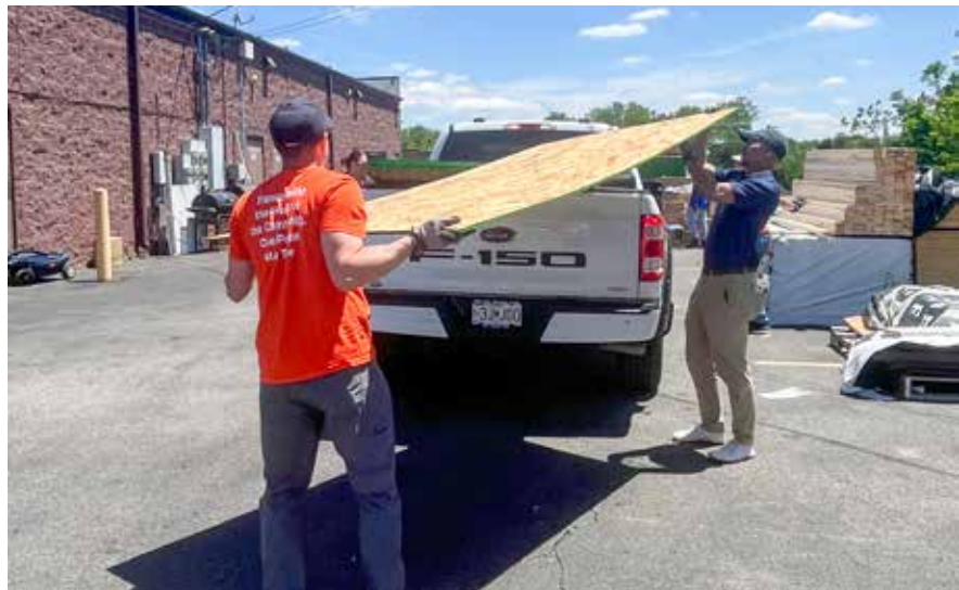
Bottom: Helping a resident impacted by the May tornado access building materials through recovery efforts at the 4TheVille Emergency Hub.