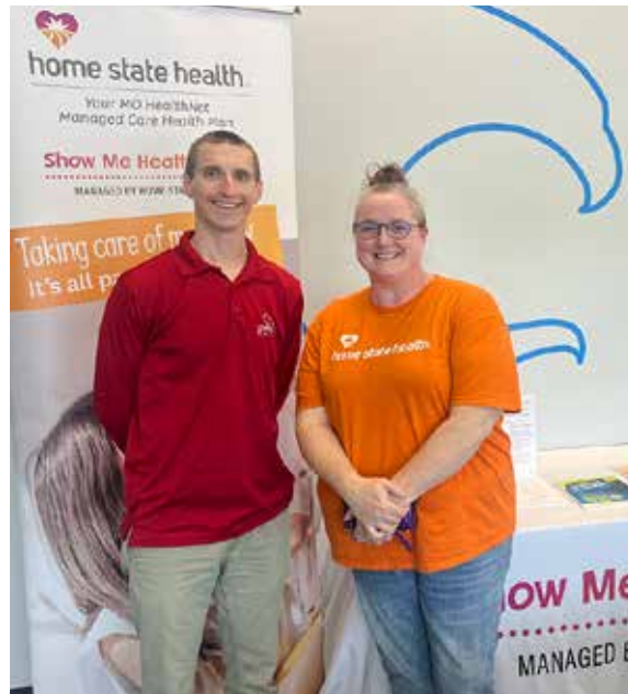
Bottom: Honoring dedicated volunteers as the presenting sponsor of the Court Appointed Special Advocates (CASA) of Southwest Missouri Volunteer Appreciation Event.