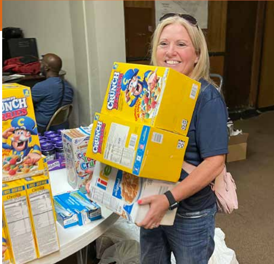
Top right: Sorting food donations as part of ongoing disaster recovery efforts.