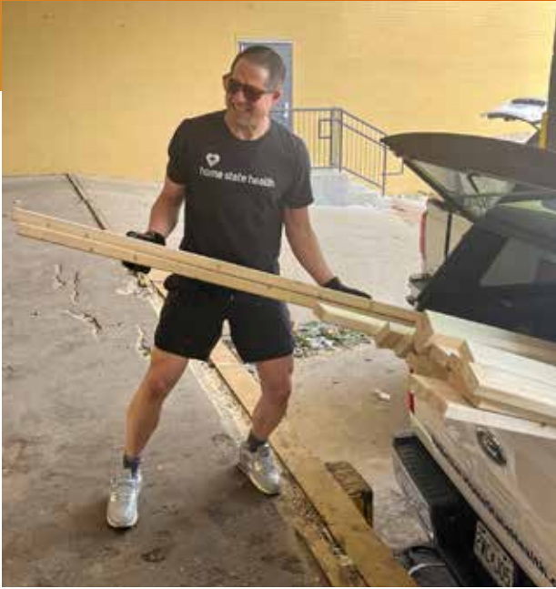
Top left: Providing hands-on disaster recovery support by unloading lumber with the Urban League of Metropolitan St. Louis.

When disaster strikes, Home State Health moves quickly—and stays engaged long after the headlines fade.