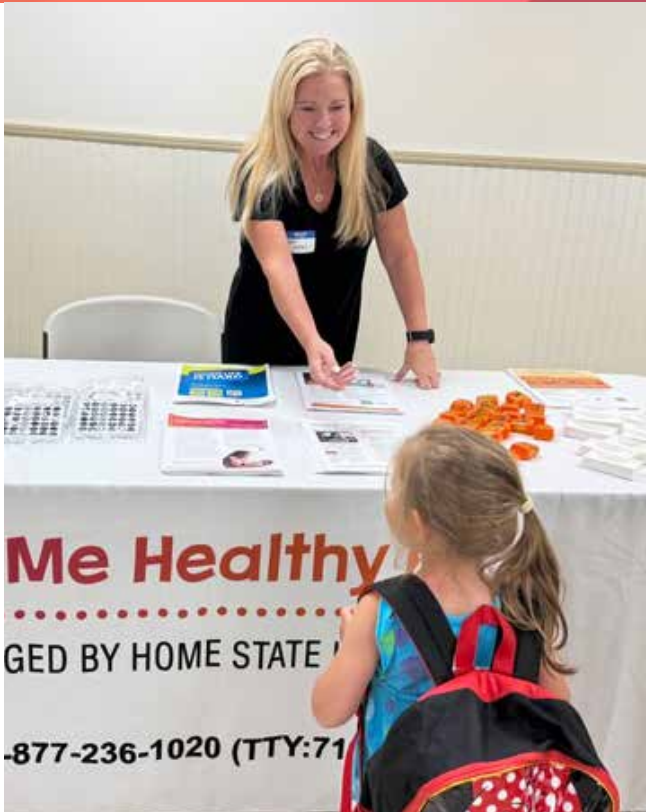
Top left: Promoting school readiness for children impacted by foster care through sponsorship of Foster Together's Back to School events.

Home State Health is Missouri's only managed care provider for foster and adoptive care members. It serves children in state custody, alternative care, and former foster youth under 26, offering Medicaid benefits, residential care, and extra services.