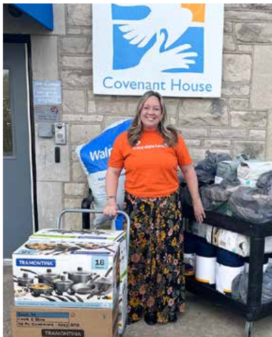
Top left: Supporting at-risk youth by delivering essential household items to Covenant House of Missouri.

Delivering Essential Resources to Strengthen Communities