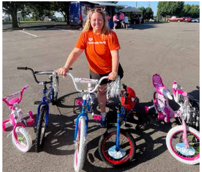
Bottom: Encouraging healthy activity and family engagement through a donation of bikes for the Jefferson County Health Department's Family Fun Day.