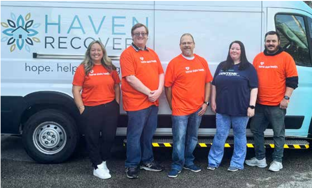
Top left: Supporting food access for local families through mobile food distribution with the St. Louis Area Food Bank.