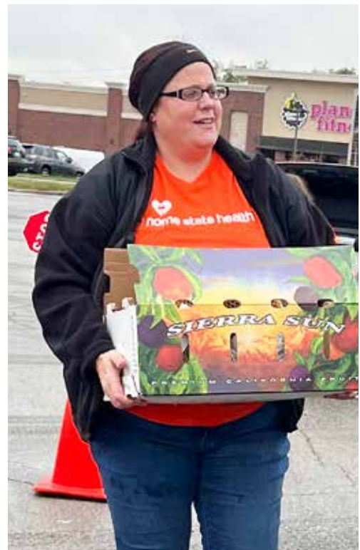
Bottom right: Ensuring families receive food by assisting with direct, drive-through distribution during a mobile food event with the St. Louis Area Food Bank.