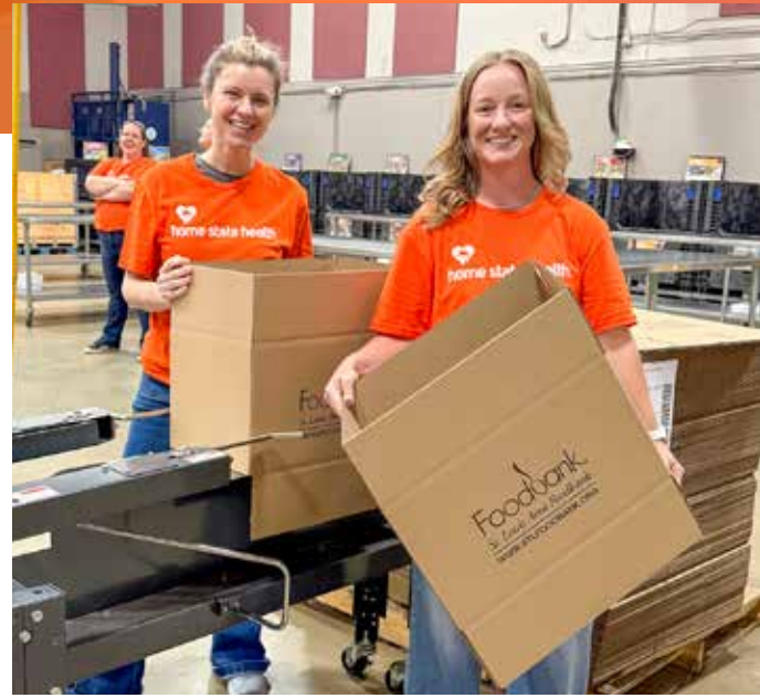
Top left and right: Hands-on service repackaging meals at the St. Louis Area Food Bank warehouse to support community distribution.