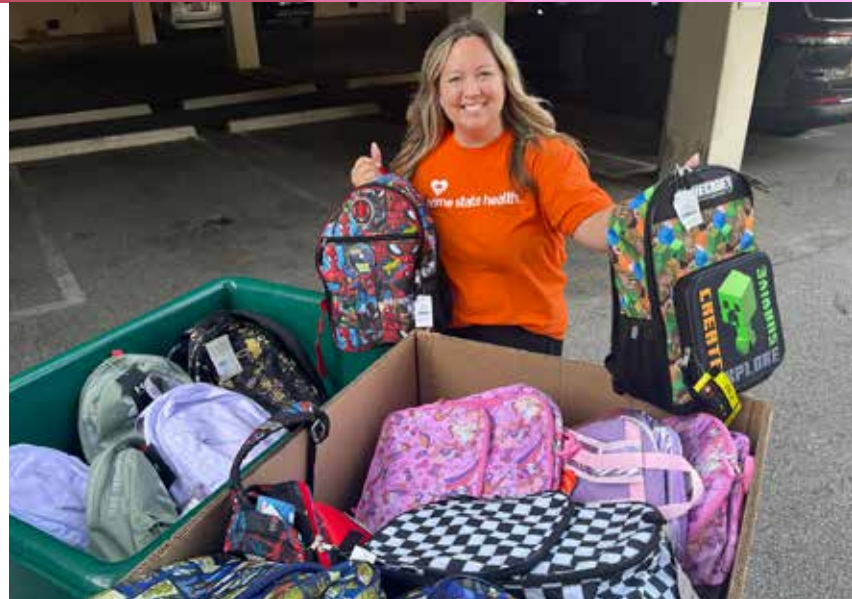
Top right: Meeting back-to-school needs by delivering backpacks stocked with school supplies to the Foster & Adoptive Care Coalition.