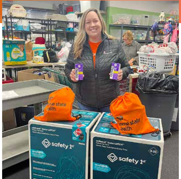
Top right: Helping meet the needs of new moms and babies through the delivery of essential items to Nurses for Newborns.