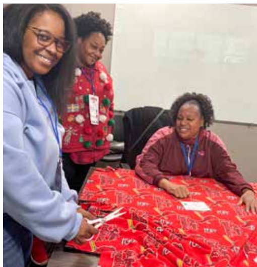
Bottom left and right: Creating fleece blankets to support children impacted by foster care through the Central Missouri Foster Care & Adoption Association.